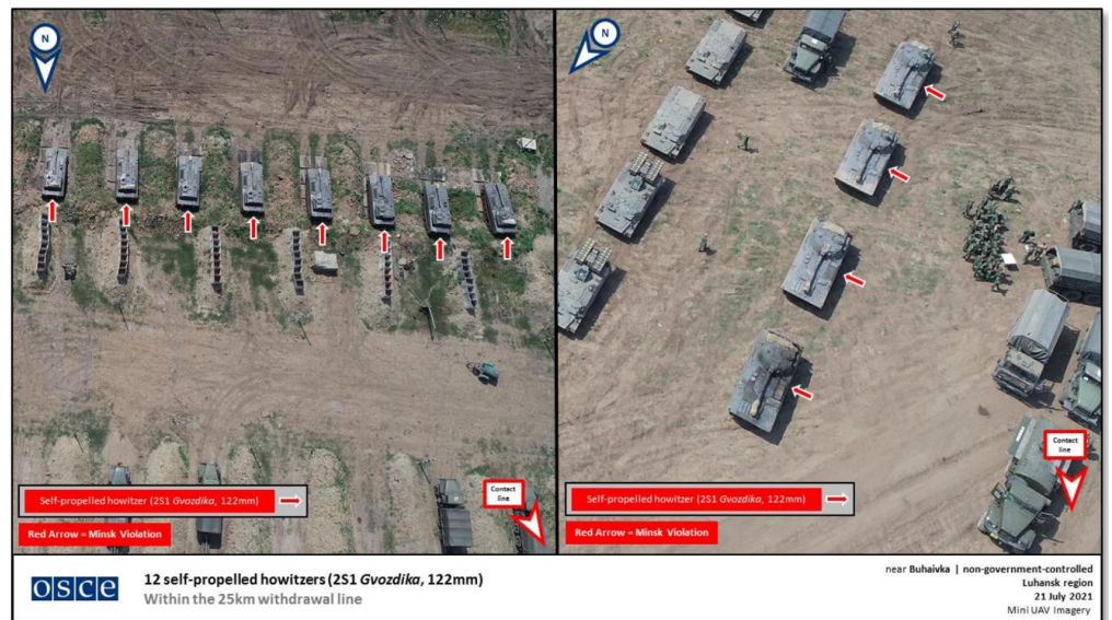
Picture 4. Observation results of the OSCE SMM UAV