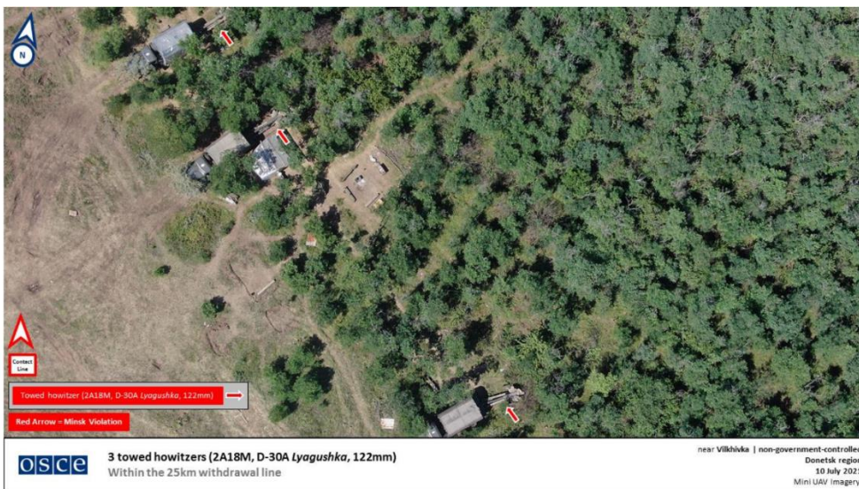
Picture 3. Observation results of the OSCE SMM UAV

July 10 this year during an observation flight, the OSCE SMM mini-UAV detected three 122mm howitzers 2A18M, D-30A, “Liahushka”, near the settlement of Vilkhivka (Donetsk region, TOT), at a distance of less than 25 km from the line of contact.