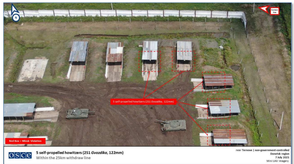
Picture 1. Observation results of the OSCE SMM UAV

July 7 this year during an observation flight, the OSCE SMM mini-UAV detected five 122mm self-propelled howitzers 2S1 “Gvozdika”, near the settlement of Ternove (Donetsk region, TOT), at a distance of less than 25 km from the line of contact.